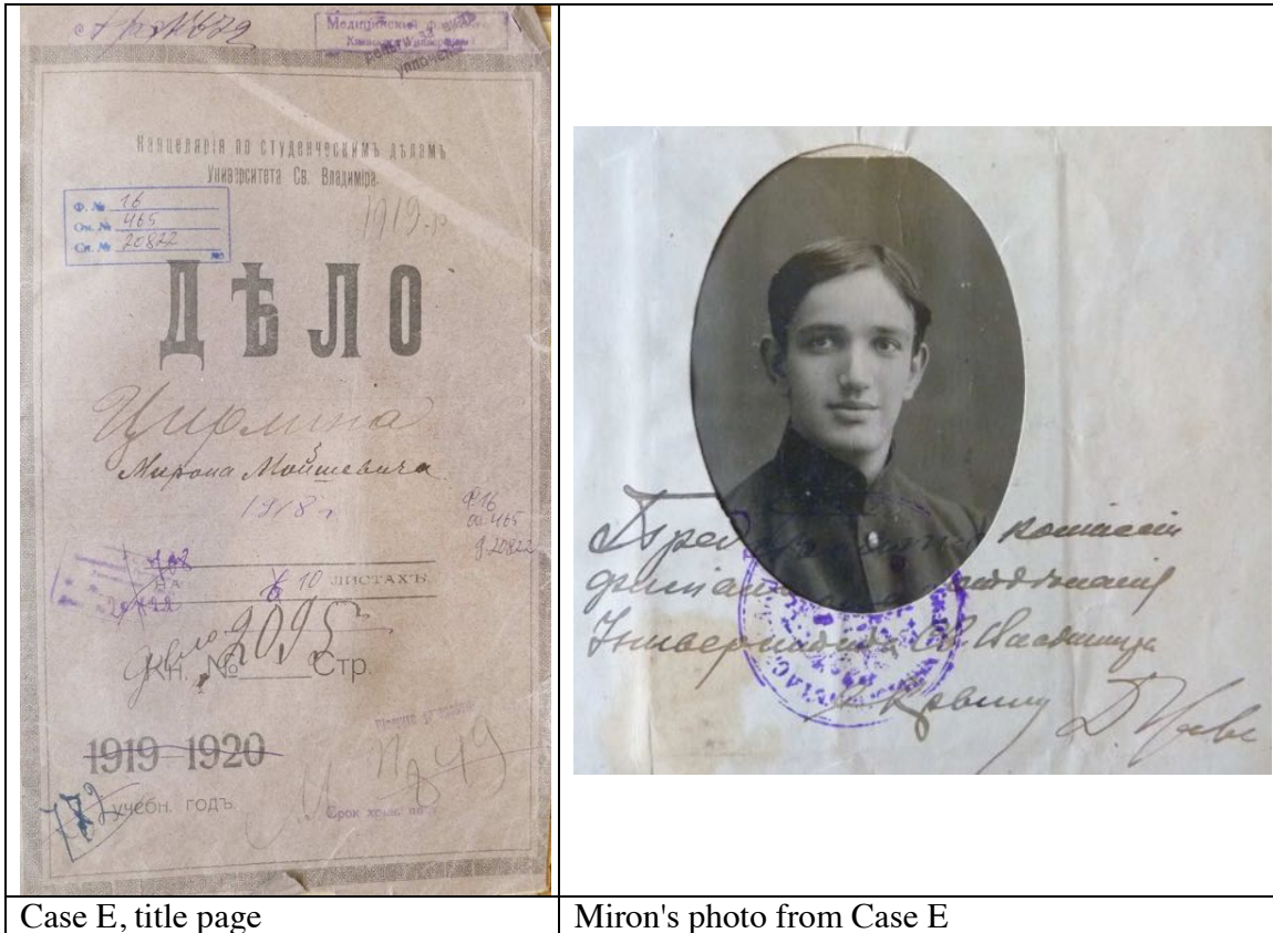
Case E, title page

Information concerning Miron is available in Case C ( http://cherlvin.nfshost.com/Trees/Tsirlin02/moise01.html ) and also in the personal case E from Kiev University archive.