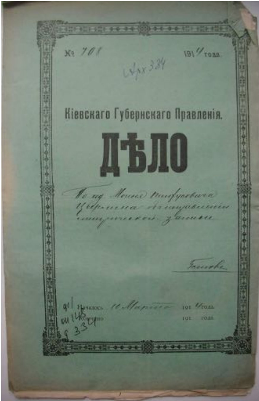
Case C, title

Note: in Russian, Tsyrlin is equivalent to Цырлин (more typical for Moisey's family), and Tsirlin is equivalent to Цирлин (frequently used by other relatives).